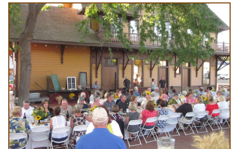
Exhibits of local history are held upstairs and many community events are held on the Depot Courtyard

Please see our web site for more information. daytonhistoricdepot.org